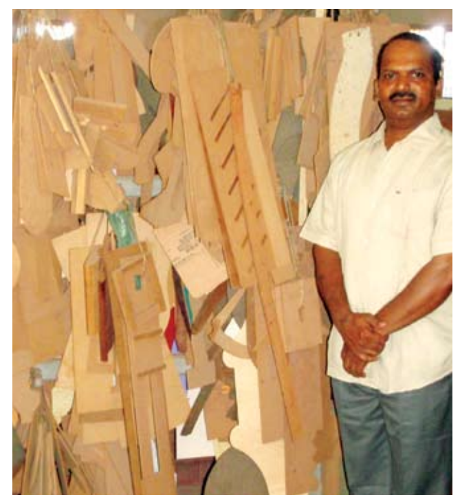
This collection of templates has been a boon to Fashion Woodworks' productivity.