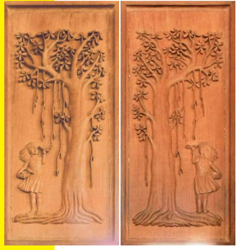
A dream-inspired design (front and back)