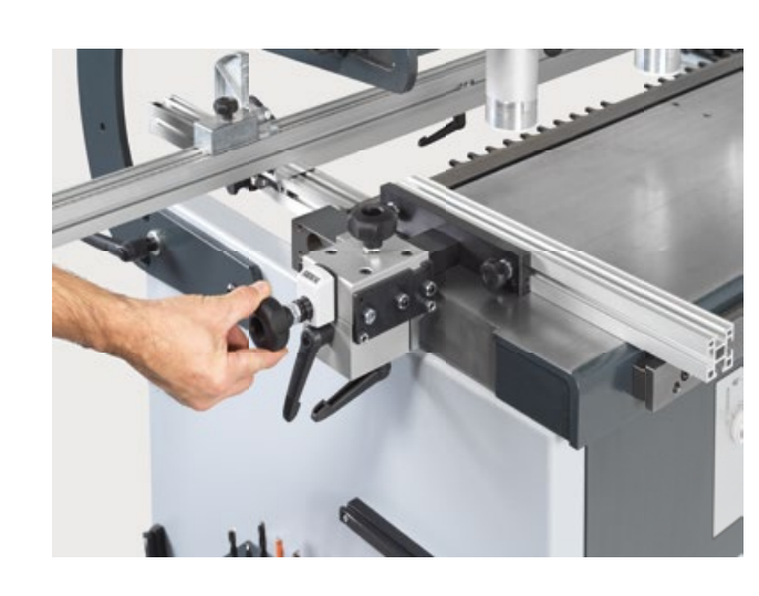
Digital lateral stops

Digital lateral fences on the left and the right side with a fence profile of 420 mm for tenths of a millimetre precision adjustment.