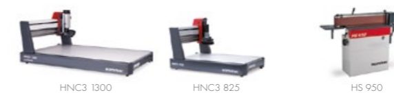
CNC Portal Milling Machine