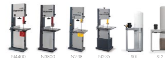
Bandsaws & Extraction Unit