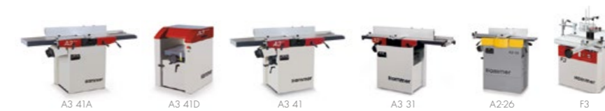
Planers & Spindle Moulder