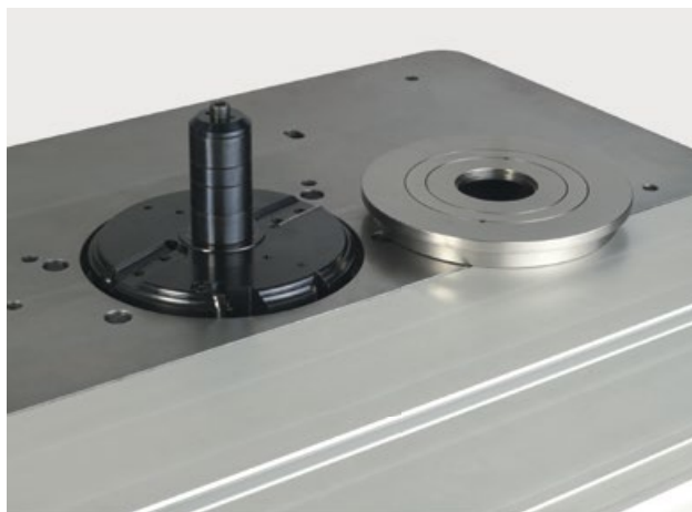
Table opening 230 mm

The large spindle table opening offers you maximum working safety: large dimensioned panel raising tools as well as slot and tenoning tooling can be used below the table surface.